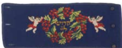
Torah binder – mappah type, cotton, wool, embroidery Bohemia, 2nd half of 19th century Inscription: Dedicated to the Lord.