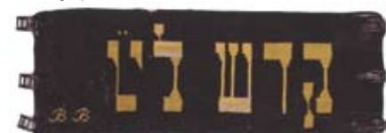
Torah binder – mappah type, needlework canvas, embroidery Bohemia, 2nd half of 19th century Inscription: Dedicated to the Lord. © JMP, acc. no. 065.576