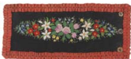
Torah binder – mappah type, velvet, appliqué Bohemia, 2nd half of 19th century © JMP, acc. no. 174.542