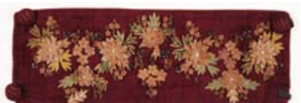
Torah binder – mappah type, plush, appliqué Bohemia, 2nd half of 19th century