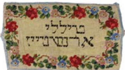
Torah binder – mappah type, needlework canvas, embroidery Bohemia, 2nd half of 19th century Inscription: Tilli Arnstein. acc. no. 023.425